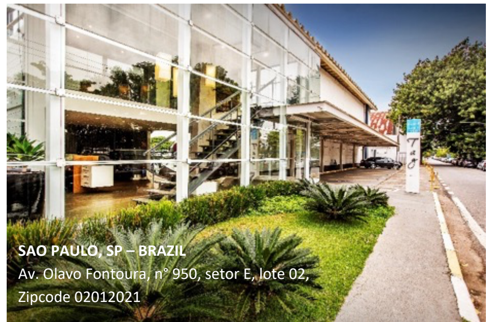
SAO PAULO, SP – BRAZIL Av. Olavo Fontoura, nº 950, setor E, lote 02, Zipcode 02012021